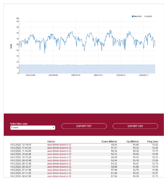
Result graph, PDF report and history